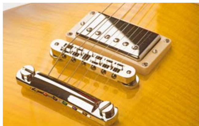
Definitive stop tail and Tune-O-Matic bridges (except '52 reissue).