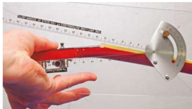
Correct authentic 17° headstock pitch.

The sound can be very impressive, especially if higher spec pickups are retro-fitted (see page 80). As with any guitar the key playability and intonation factor is a good set-up (see page 34).