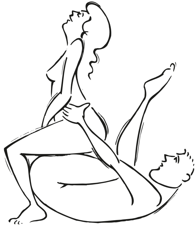
Hot pants on a hot seat

This is the ultimate fantasy for a woman who likes to pass water while making love. The man lies on his back with his legs drawn to his chest. She then sits on top of his penis and buttocks. She can now hold his testicles while he supports her waist. Golden Showers all round folks, don't forget to change the sheets.