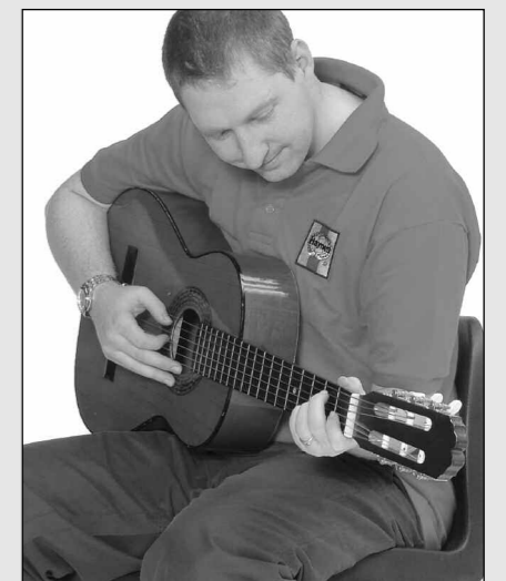
Making music takes your mind off food, at the very least

Do you know any Beatles' songs? The kids might know one or two. The guitar is a cool instrument, and you don't have to be Eric Clapton to become a pretty competent player. A second-hand guitar can be bought for about £30, and once you've bought a couple of good music books, there is very little on-going additional cost. There are some good Beatles guitar books out there. Get some advice, but you'll find that most of these start with simple stuff and move on to the more complex pieces, but the beauty of this is you learn at your own rate. If there's someone you know who plays already – they'll be a help, but with the right book you'll be amazed at how quickly you get going with it and the kids'll be well impressed. Even just 10 minutes a day – you'll be strumming Yellow Submarine in a fortnight. Once you've mastered Beatles, the rest will follow. At Christmas time, carols are easy to master and are a must.