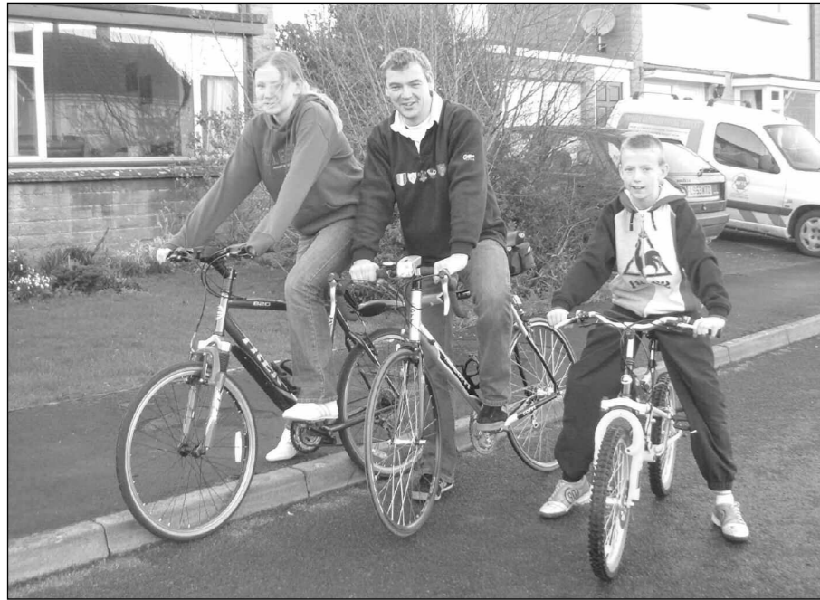
Go out for a cycle ride with the children (but don't forget the helmets!)

energetic and fun. These are the ideal characteristics of a father as a healthy role model.